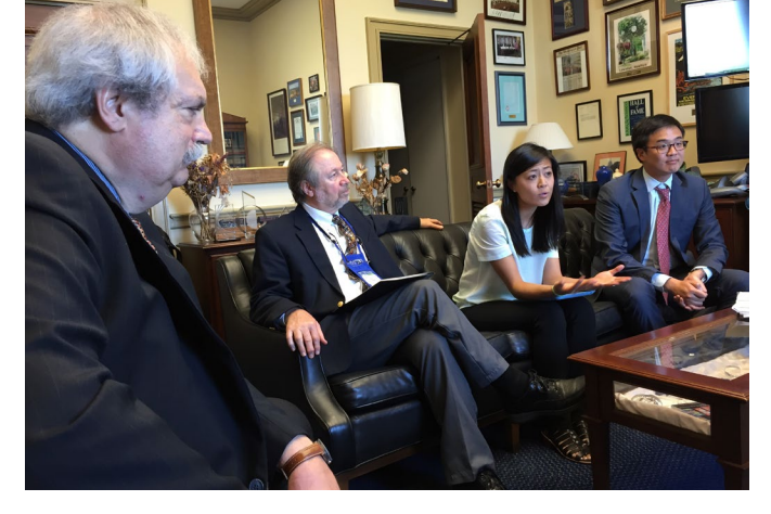
PICTURED ABOVE: THE ASTRO MEMBERS FROM THE STATE OF NEW YORK SPOKE ABOUT ASTRO'S PRIORITIES IN A CONGRESSWOMAN'S OFFICE AT ASTRO'S FLY-IN.

"I started in the field in 1974," he said. "It's nice to see these young residents carrying it forward."