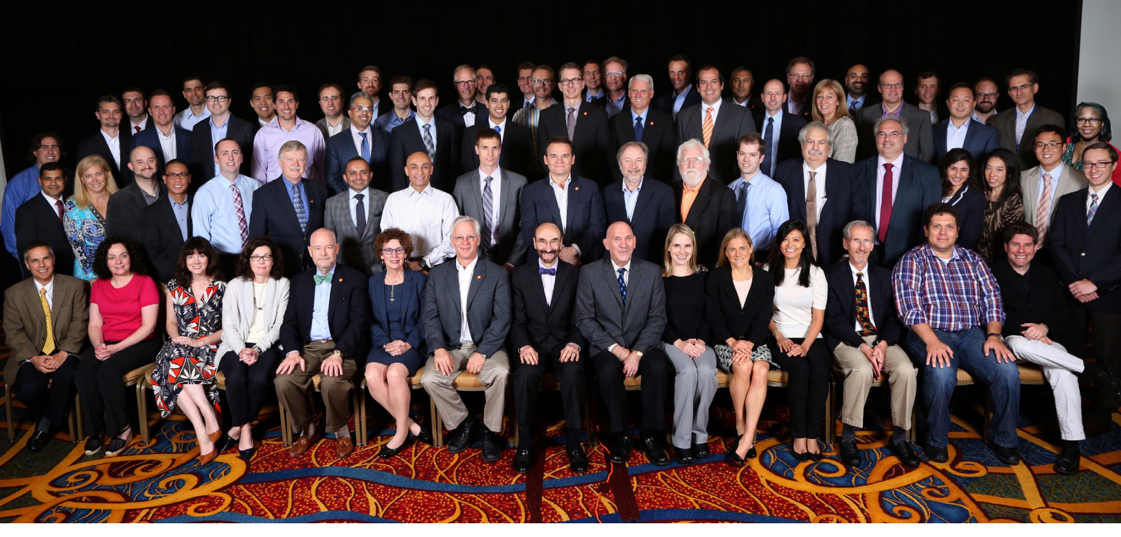
THIS YEAR, NEARLY 100 ASTRO MEMBERS ATTENDED THE 13TH ANNUAL ADVOCACY DAY EVENT.